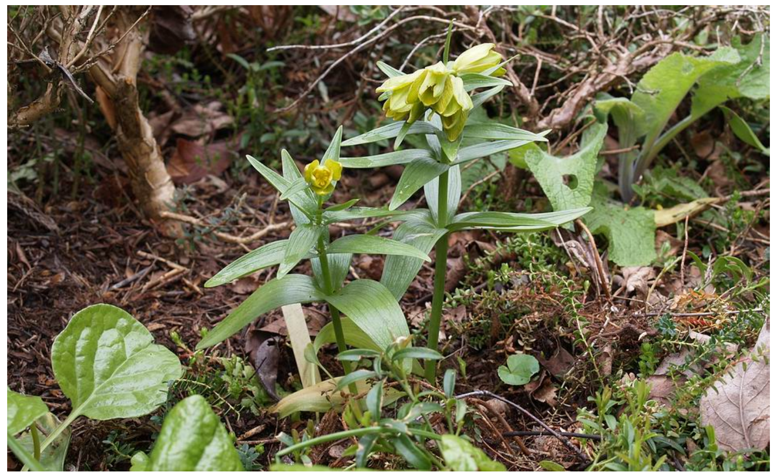
Fritillaria camschatensis aurea

I am also pleased to have strong growing yellow form of Fritillaria camschatensis.