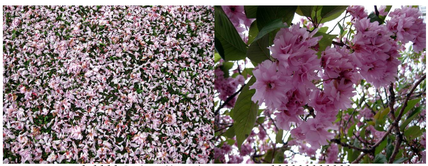
I woke up this morning.....