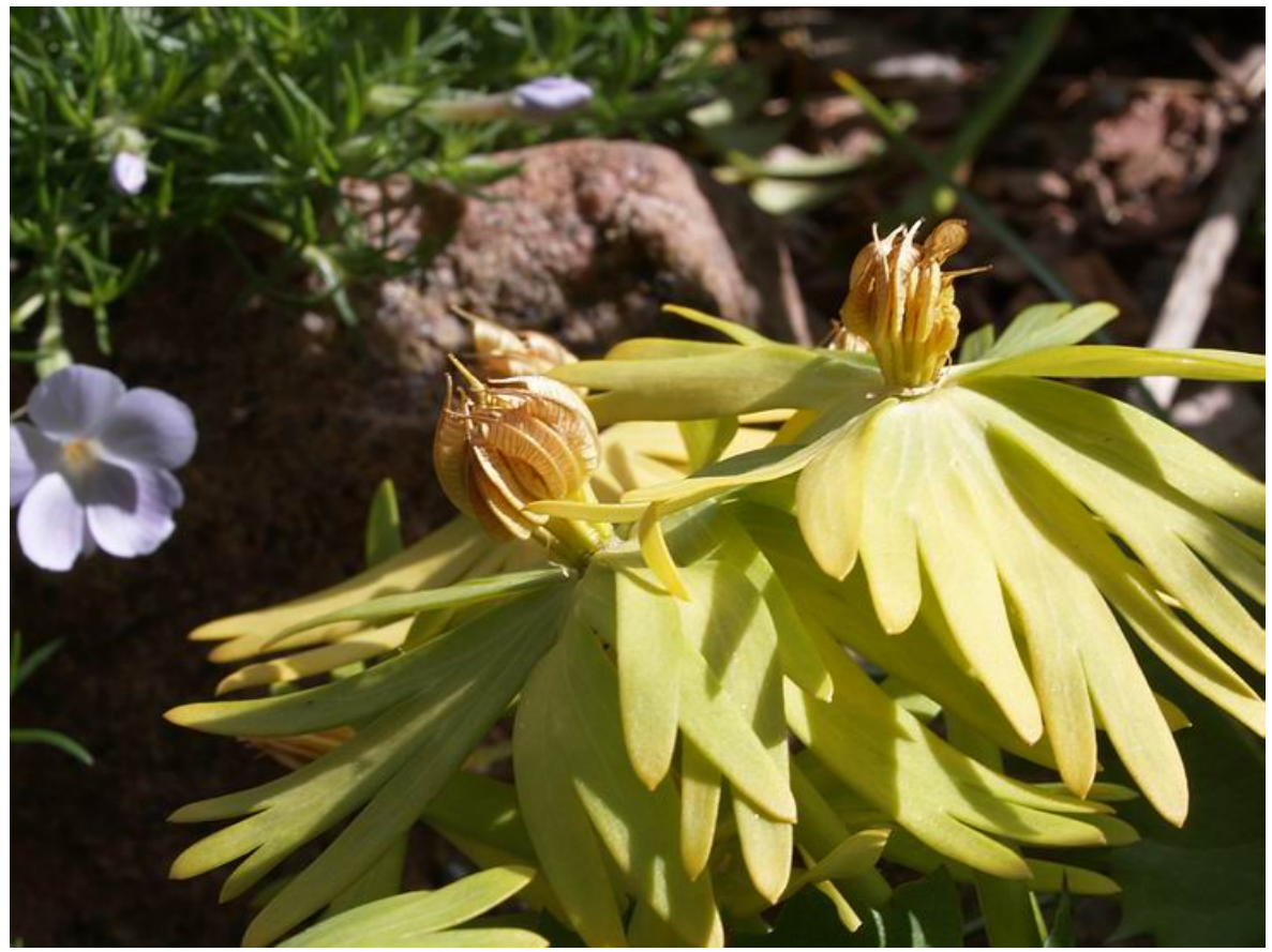
Eranthis 'Guinea Gold' seed heads

This week I have been collecting our Eranthis hyemalis seeds which have provided an excellent harvest. For many years I have just allowed the seed to distribute by its own means allowing the plants to naturalise but now these areas have reached a fairly intense density so I have scattered the seeds into other areas where I would like to enjoy this early flowering beauty.