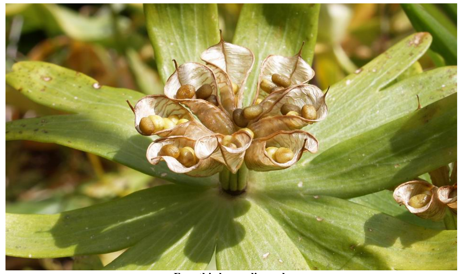
Eranthis hyemalis seeds

This week I have been collecting our Eranthis hyemalis seeds which have provided an excellent harvest. For many years I have just allowed the seed to distribute by its own means allowing the plants to naturalise but now these areas have reached a fairly intense density so I have scattered the seeds into other areas where I would like to enjoy this early flowering beauty.