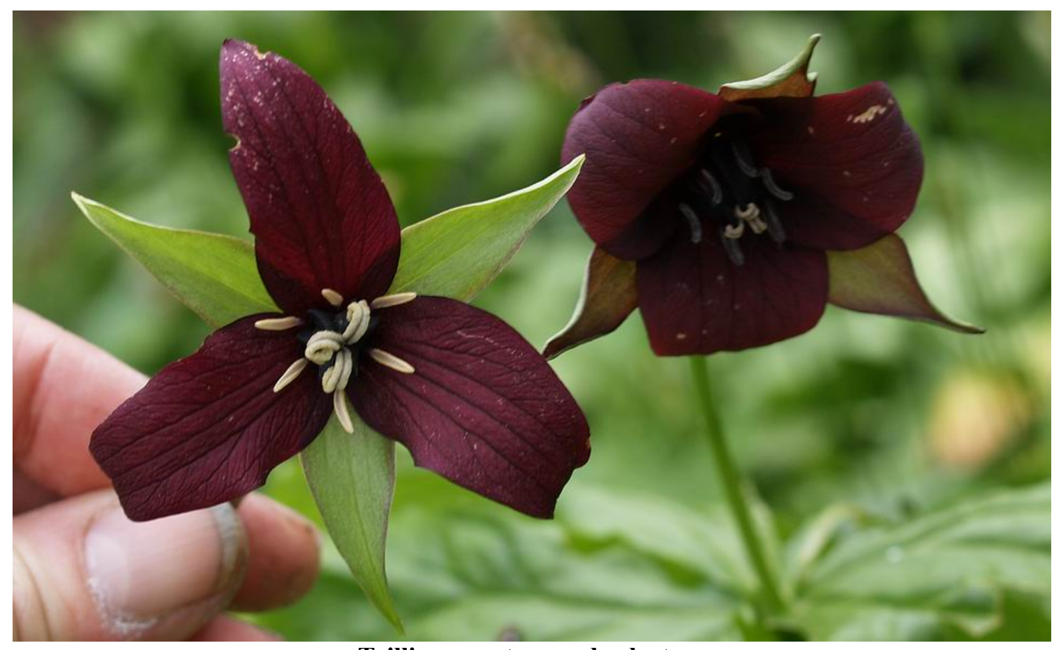
Trillium erectum and sulcatum

I read in the forum recently that I was not alone in having had trouble in seeing the difference between Trillium erectum and Trillum sulcatum. For years this troubled me until a number of years ago a pot of seedlings matured and flowered to reveal to me that I had never grown the true T. sulcatum before – all the material I had previously acquired had been wrongly named sulcatum and was in fact T. erectum. Once you have seen the two species you can quickly tell them apart.