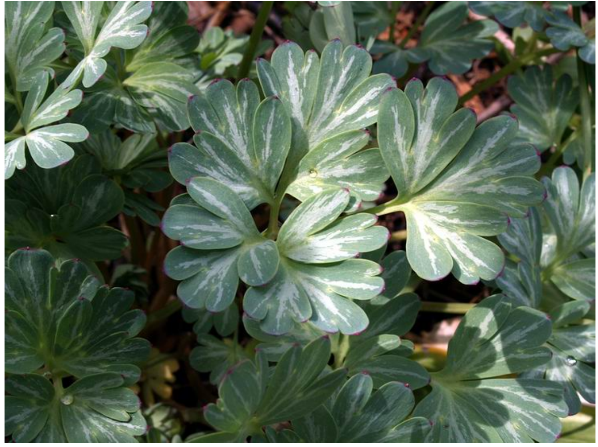
Corydalis pseudobarbisepala leaves

It is a very striking and distinct species with very beautiful leaves which alone make it unlikely to be confused with any of the other species I know.