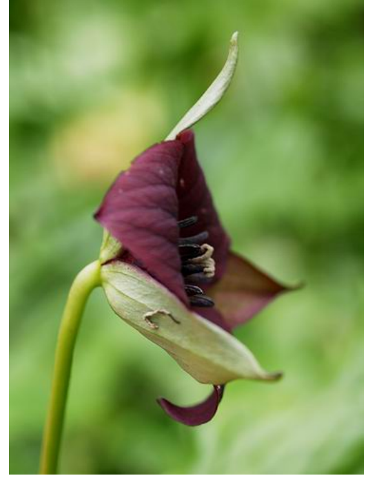
Trillium erectum and sulcatum

The easiest way for gardeners to distinguish them is to look at the flowers from the side – T erectum has an open flower and you can see all the base of the ovary from the side view while the petals of T. sulcatum form a shallow cup that hides the lower part of the interior with just the stigma and the tips of the stamens visible from a side view.